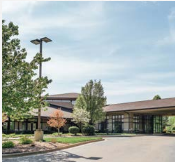
Faith Hospice at Trillium Woods 8214 Pfeiffer Farms Dr SW | Byron Center, MI 49315

Faith Hospice provides compassionate, dignified end-of-life care to all people regardless of their race, creed, religion, or financial situation. We are blessed by faithful donors who make it possible to offer care to patients and their families who are unable to pay the full cost of our services.